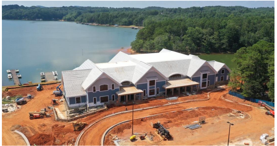
A new boathouse at the Lake Lanier Olympic Park is under construction, to be completed in 2024. The renovated boathouse will provide over 10,000 square feet of meeting space, including a ballroom and boardroom available for rental. A 3,000-square-foot pavilion was recently completed in the Park's Plaza for year-round events.