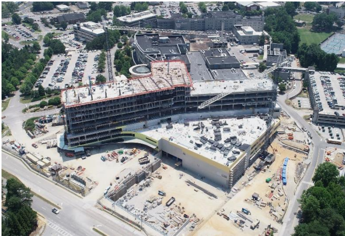
Northeast Georgia Health System recently topped out their new, multi-story patient tower at the Northeast Georgia Medical Center Gainesville campus. Currently scheduled to open in 2025, the new Patient Tower in Gainesville will be a 927,000-square-foot expansion that will make NGMC Gainesville the third-largest hospital in Georgia (by beds).