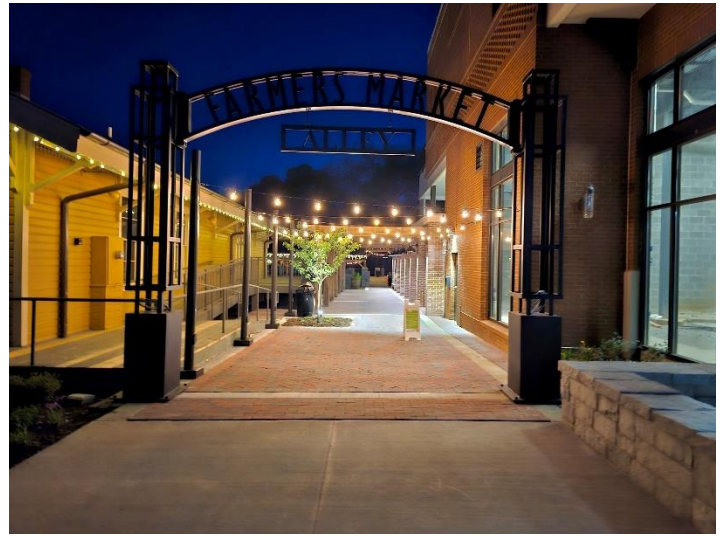
The new Flowery Branch Farmers Market Pavilion is the latest addition to the historic Downtown area with new retail, event spaces, residential developments, and restaurants in a vibrant and walkable community that continues to maintain its historic charm.