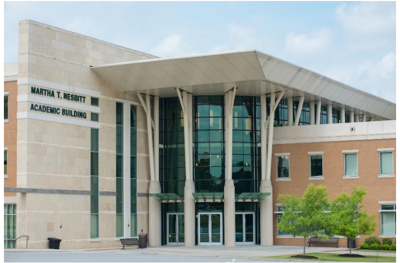
University of North Georgia (UNG) – Gainesville Campus. Throughout 2023, UNG is celebrating 150 years of higher education in Northeast Georgia