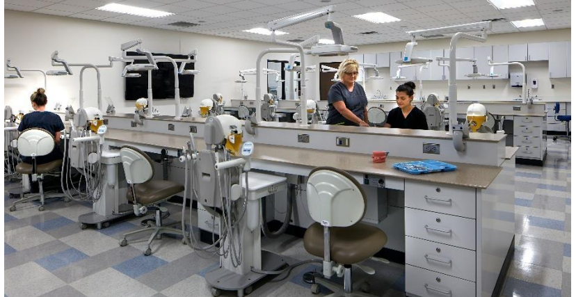
Lanier Technical College Dental Hygiene Lab – Gainesville Campus