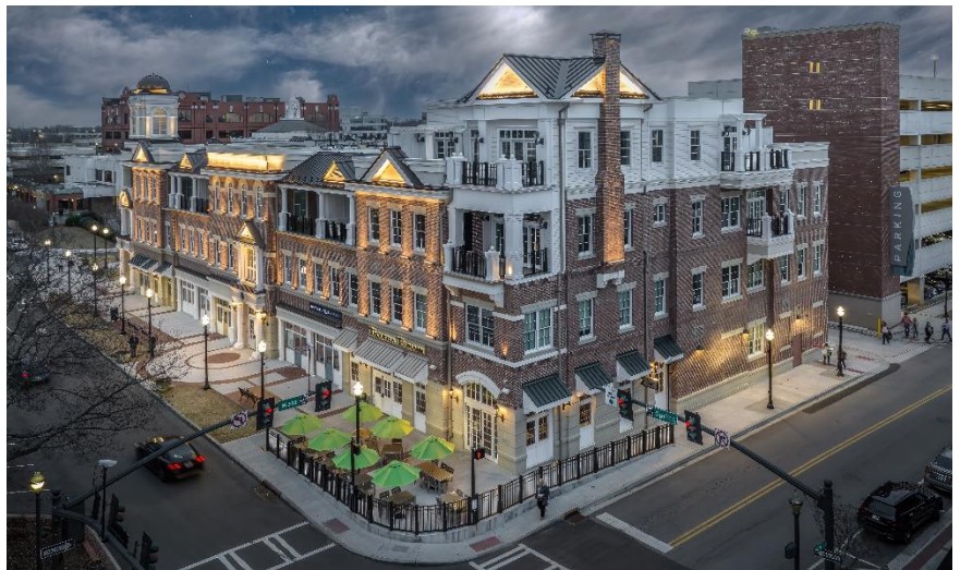
Gainesville Renaissance, a mixed-use development in Downtown Gainesville includes retail, condos and restaurant space, and houses Brenau University's Lynn J. Darby School of Psychology and Adolescent Counseling.