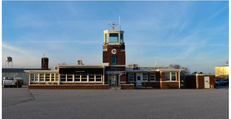
The recently renovated Lee Gilmer Memorial Airport terminal in Gainesville