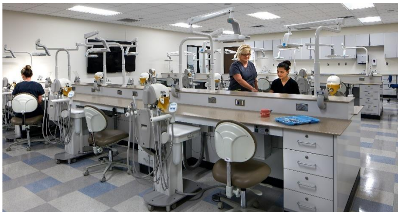
Lanier Technical College Dental Hygiene Lab – Gainesville Campus