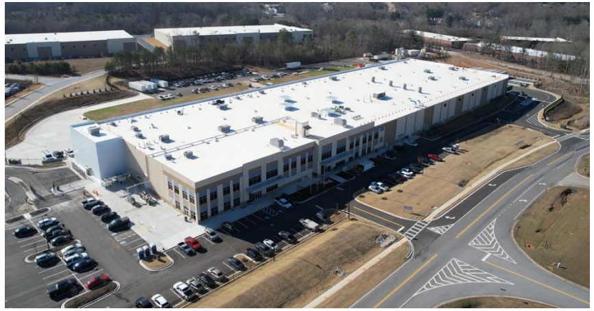
King’s Hawaiian expanded its Oakwood presence with a $100 million facility that will produce pretzels, creating more than 160 new jobs. This new 150,000-square-foot bakery is located adjacent to the King’s Hawaiian’s facility on Aloha Way in the Oakwood South Industrial Park.