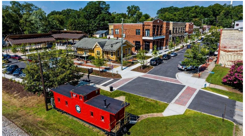
The new Flowery Branch Farmers Market Pavilion is the latest addition to the historic Downtown area with new retail, event spaces, residential developments, and restaurants in a vibrant and walkable community that continues to maintain its historic charm.