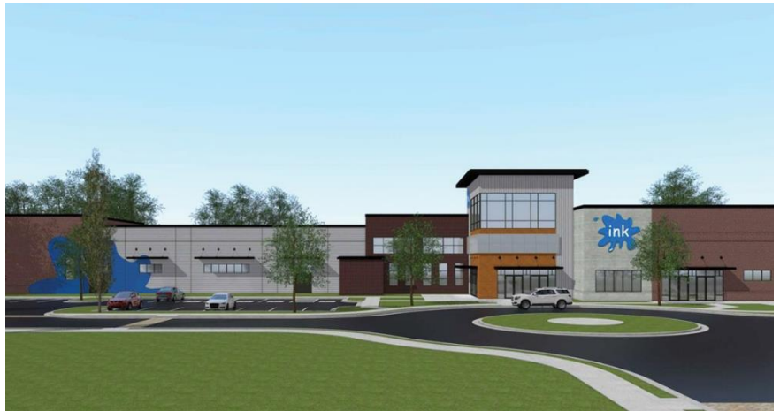
Interactive Neighborhood for Kids (INK) has started construction on their new $13.3 million, 35,000 SF museum located in Downtown Oakwood. INK is targeting an open date for the new museum in 2025.