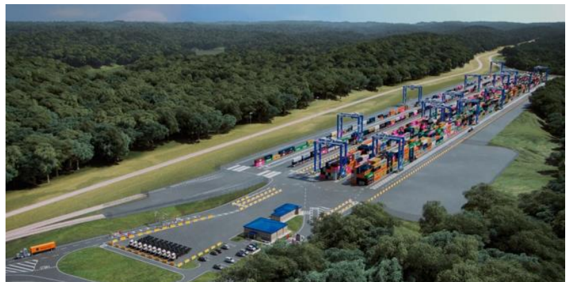
Rendering of the new Blue Ridge Connector set to open in 2026.