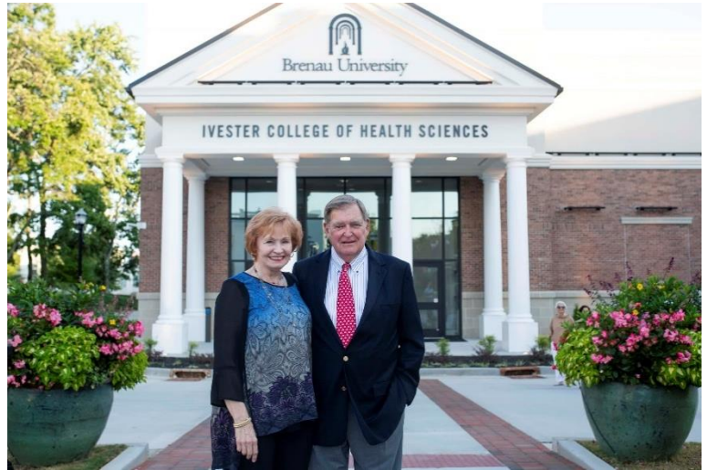
Brenau University recently dedicated major facility improvements to the Ivester College of Health Sciences and the Lynn J. Darby School of Psychology and Adolescent Counseling located in the Brenau Downtown Center and Gainesville Renaissance. The Doug and Kay Ivester Foundation has made a huge impact on education in Gainesville-Hall County through gifts to Brenau University and other educational institutions in the community.