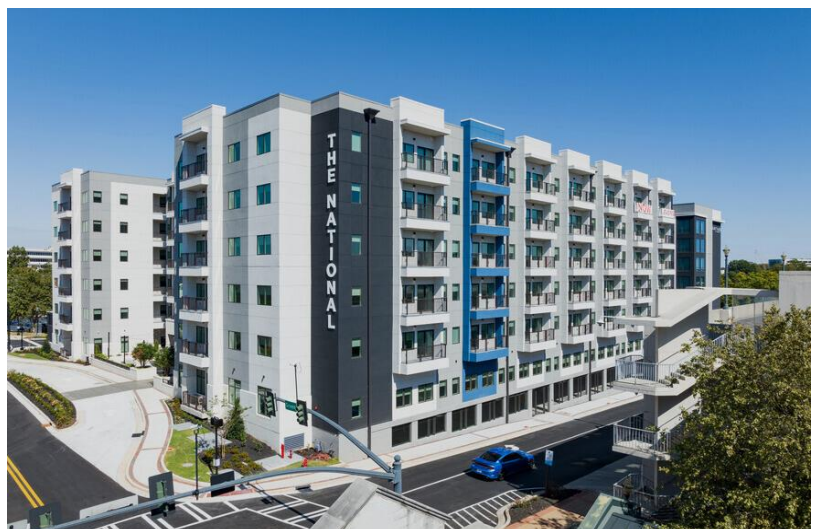
The National in Downtown Gainesville, a development by Capstone Property Group, opened a 153-unit studio apartment building opposite the new Courtyard Marriott Hotel in 2023.