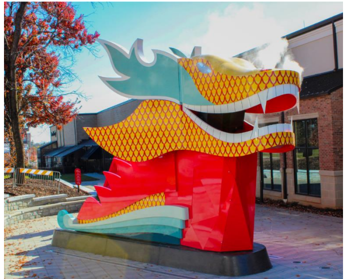
Newly constructed interactive dragon statue, paying homage to the Atlanta Hong Kong Dragon Boat Festival, which has been hosted at Lake Lanier Olympic Park for the last 26 years.