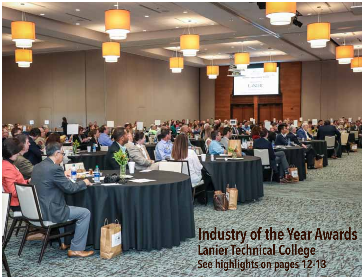
Industry of the Year Awards Lanier Technical College See highlights on pages 12-13

Tuesday, December 14 Small Business Seminar In Person & via Zoom