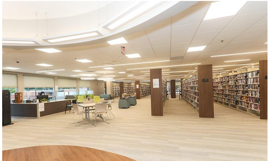
The Hall County Library – Gainesville Branch recently completed $5 million in renovations including study rooms and the new Sandra Dunagan Deal Storytime Room.