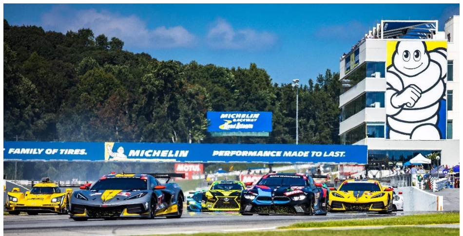
The new Michelin Tower at Michelin Raceway Road Atlanta opened in fall 2019. The state-of-the-art facility houses four stories of hospitality suites, a media center, a rooftop deck and more.