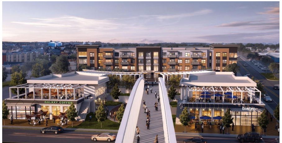
Solis Gainesville, a $48 million mixed-use project including retail/restaurant space and 220 market-rate apartments, is currently under development and will be complete in May 2022.