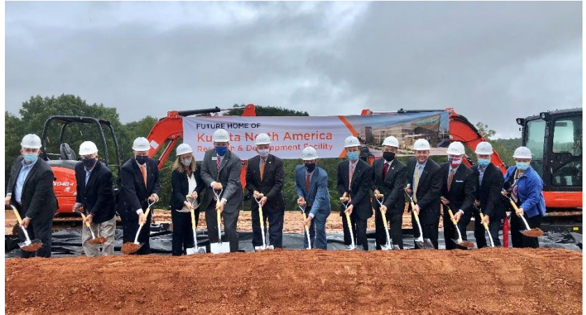
Kubota Manufacturing of America Corporation (KMA) was joined by Governor Brian Kemp, Hall County elected officials, and community leaders to break ground for their new, 280-acre engineering and design center. Gainesville-based Carroll Daniel Construction is the design builder for the project.