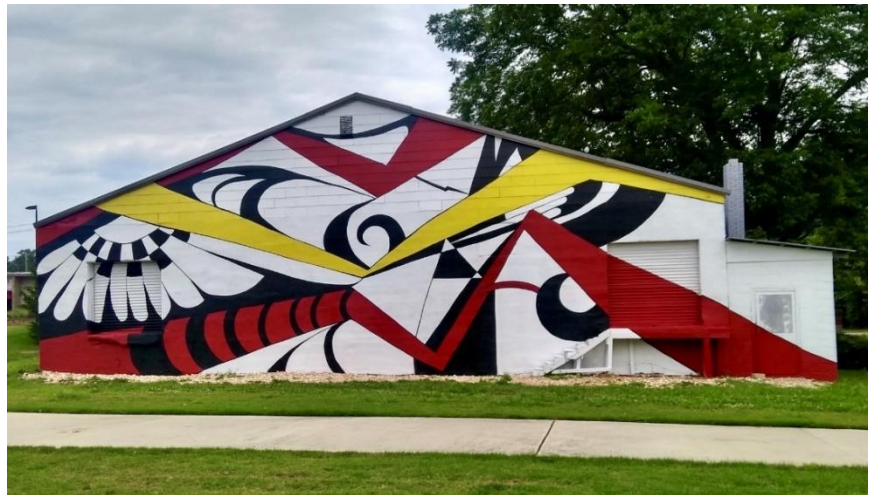
The Lost Wall (pictured above) is a newly recreated mural commemorating the original mural painted as a Gainesville Arts Council bicentennial project in 1974. Vision 2030 Public Art Committee and community volunteers completed the mural using the colors red, yellow, black and white to represent diversity and unity within the community.