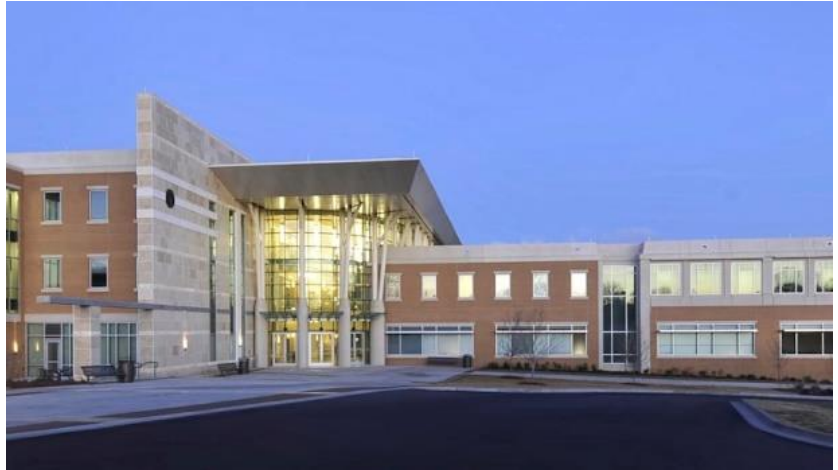
University of North Georgia – Gainesville Campus