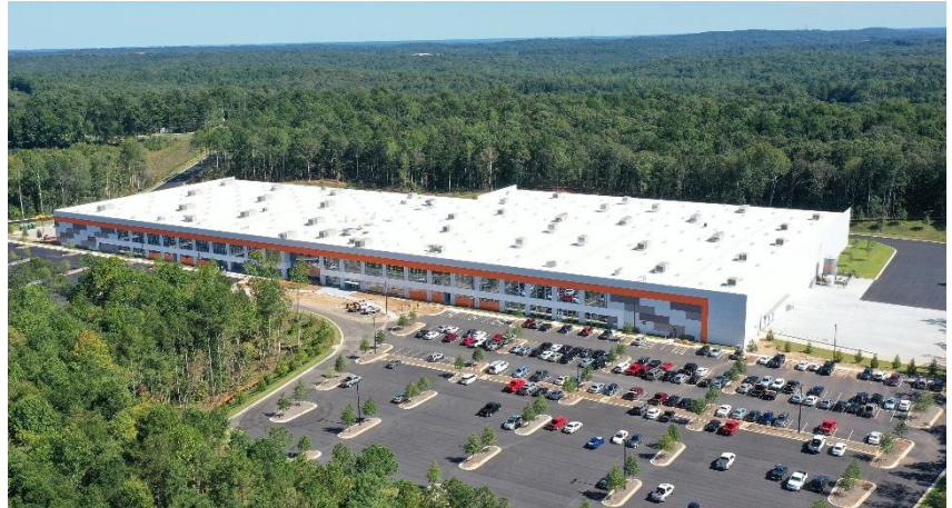
Fox Factory's new, 320,000 sq. ft. manufacturing headquarters was recently completed in Gainesville Industrial Park West.