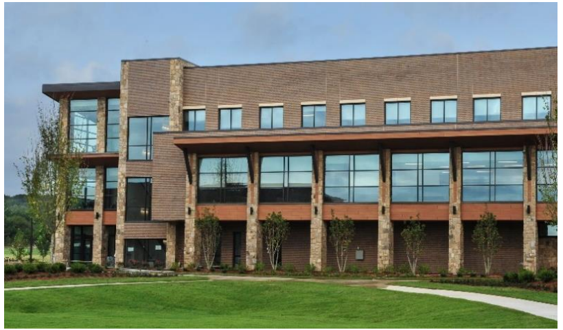
Lanier Technical College – Gainesville Campus