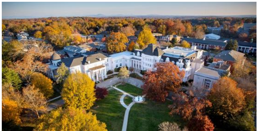
Brenau University – Gainesville Campus