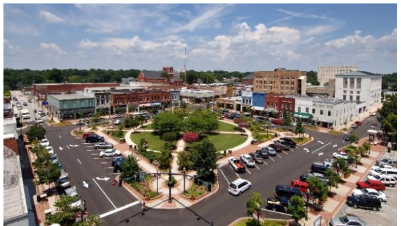
Gainesville's Downtown Square has Main Street USA designation and offers unique dining and shopping experiences.