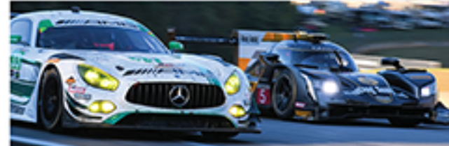
See the likes of Corvette, Acura, Audi, Porsche, BMW, Ford, Ferrari, Cadillac, Lexus, Lamborghini, Mercedes AMG and more fight for the top spot.