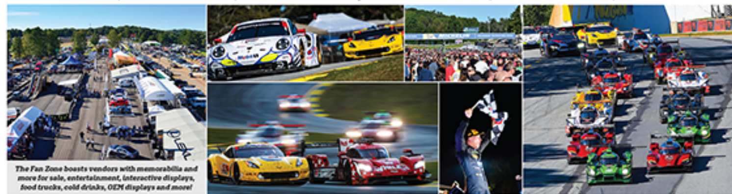
The Fan Zone boasts vendors with memorabilia and more for sale, entertainment, interactive displays, food trucks, cold drinks, OEM displays and more!