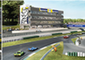
The New Michelin Tower Grand Opening Expected at Motul Petit Le Mans