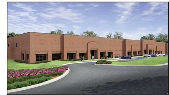
Multi-Unit Spec Building, Site #8 10,118 - 94,461 SF 5445 Rafe Banks Drive