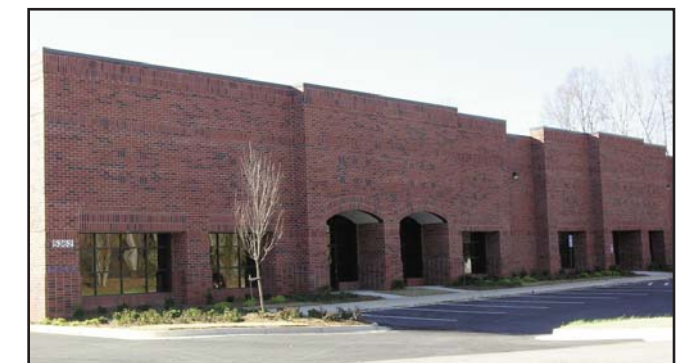
Multi-Unit Building, Site #15 8,372 - 41,860 SF 5362 McEver Road