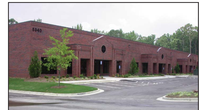
Multi-Unit Building, Site #14 6,400 - 64,000 SF 5340 McEver Road