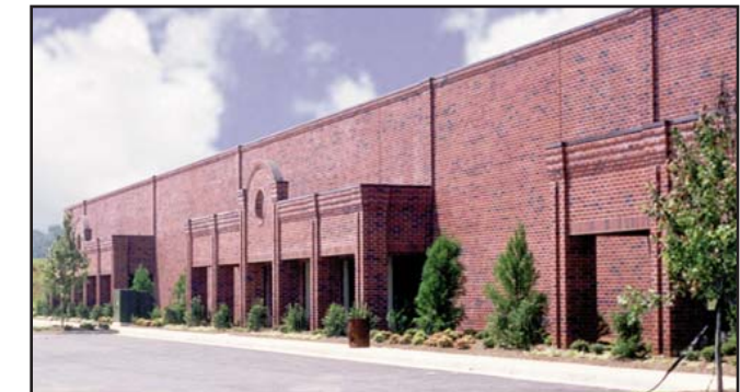
Multi-Unit Building, Site #9 9,914 - 81,040 SF 5405 Rafe Banks Drive