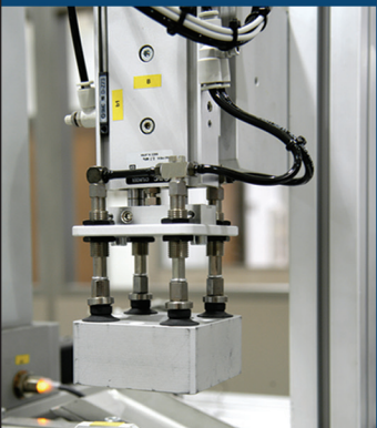
Automated Manufacturing R/D